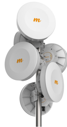
B5 - 6 Dish Collocation