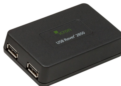
Remote Extender (REX)