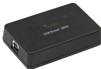
Local Extender (LEX)

www.icron.com sales@icron.com +1 604 638 3920